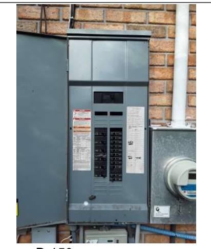
Square D-150 amps